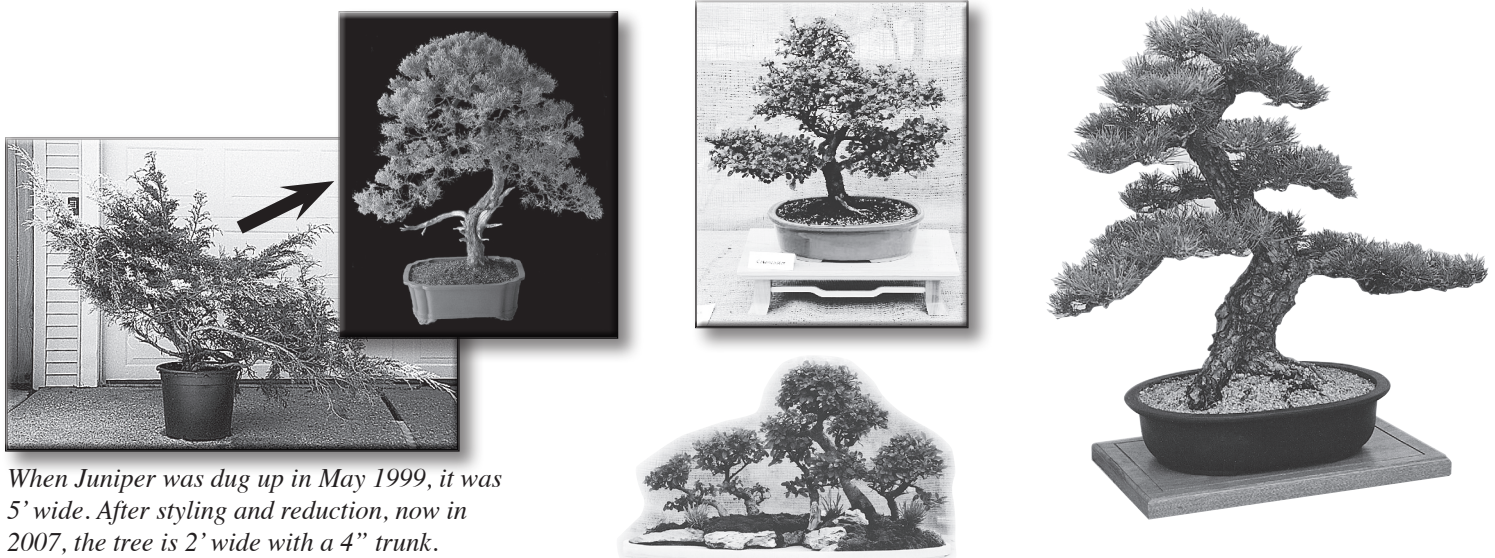
When Juniper was dug up in May 1999, it was 5' wide. After styling and reduction, now in 2007, the tree is 2' wide with a 4" trunk.

A t the meetings you will learn the techniques used to develop, train and maintain bonsai trees from common nursery stock, collected trees from the wild or from pre-bonsai stock which can also be purchased. Shown below are some photos of actual member trees.