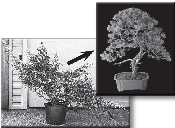
When Juniper was dug up in May 1999, it was 5' wide. After styling and reduction, now in 2007, the tree is 2' wide with a 4" trunk.

A t the meetings you will learn the techniques used to develop, train and maintain bonsai trees from common nursery stock, collected trees from the wild or from pre-bonsai stock which can also be purchased. Shown below are some photos of actual member trees.