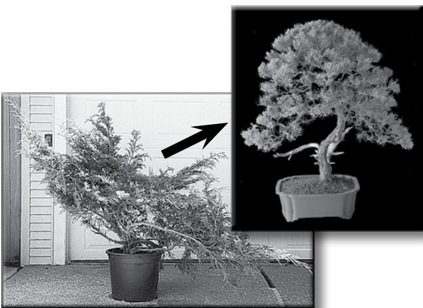
When Juniper was dug up in May 1999, it was 5' wide. After styling and reduction, now in 2007, the tree is 2' wide with a 4" trunk.

At the meetings you will learn the techniques used to develop, train and maintain bonsai trees from common nursery stock, collected trees from the wild or from pre-bonsai stock which can also be purchased. Shown below are some photos of actual member trees.